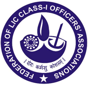
Federation of LIC of India Class I Officers' Association (Union of Class I Officers)